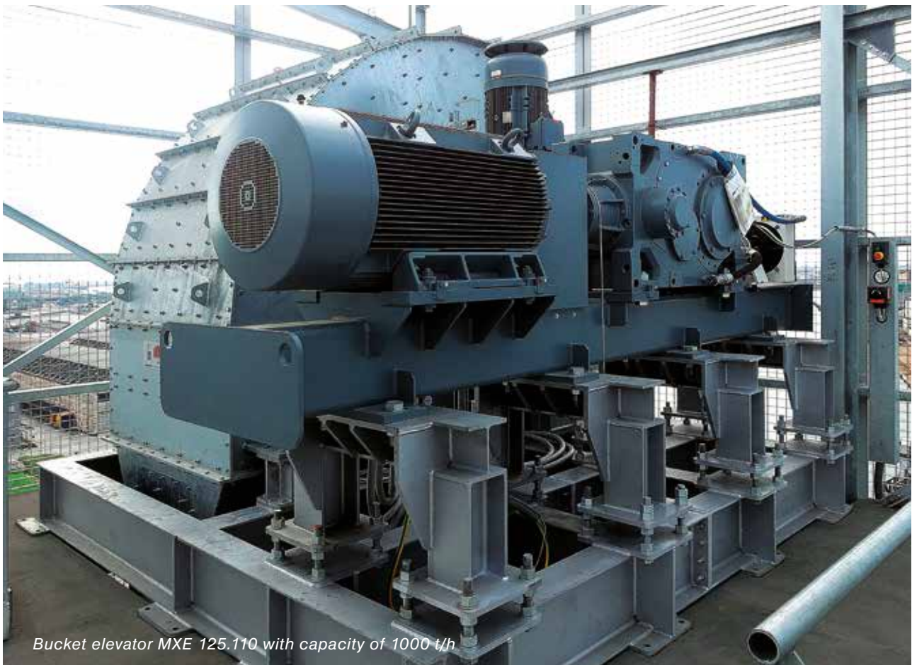
Bucket elevator MXE 125.110 with capacity of 1000 t/h