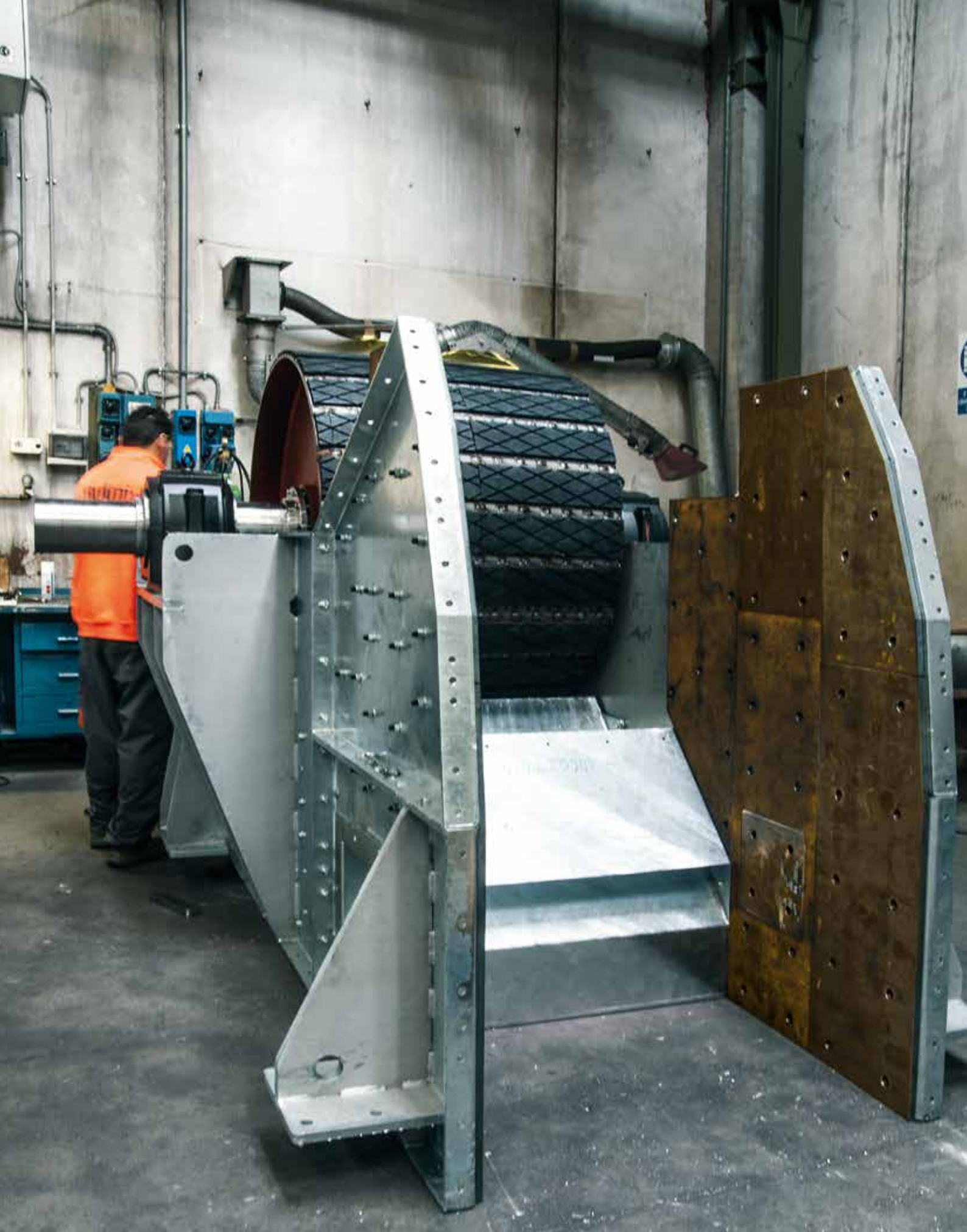
Head structure of MXE 127.70