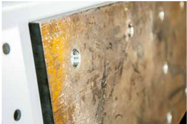
Hardox anti-wearing covering